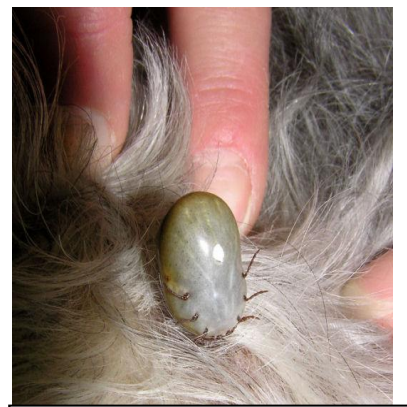
An engorged tick attached to dog's skin

One risk on country walks is the parasites that can be picked up and especially significant are ticks and the potential risks posed by the diseases they can carry. Ticks are blood-feeding parasites which are widespread and can inhabit woodland, scrub and rough moor and grassland. Often feeding on deer and other wildlife, ticks lie in wait until they detect an animal (or human!) wandering past whereupon they attach and commence feeding until fully engorged with blood. An adult tick can ingest as much as 8ml of blood in one meal, so infestations with multiple ticks can be particularly unpleasant.